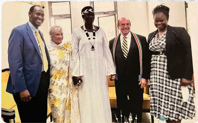
Undying Hope team meeting with the Minister of General Education and Instruction