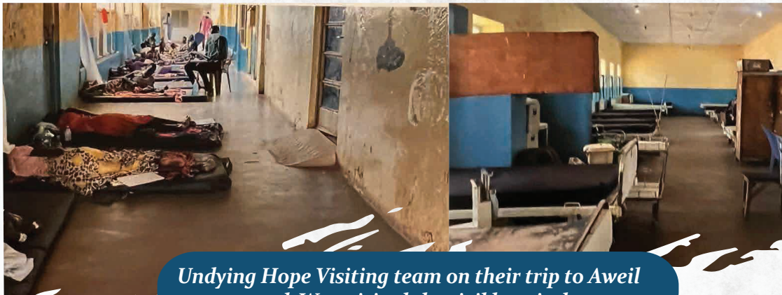
Undying Hope Visiting team on their trip to Aweil and Wau visited the civil hospital