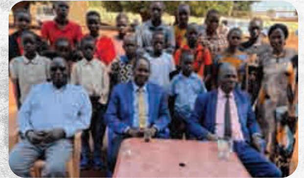
Theil meeting with the State Minister of Education and Instruction for Western Bahr El Ghazal State and Undying Hope Scholarship Recipient