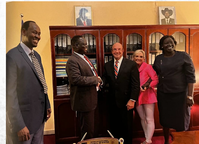
Undying Hope visiting team meeting with Rt. Hon. Speaker and Deputy Rt. Hon. Speaker at the National Legislative Council of States

The government is making significant steps in increasing budgetary allotment to the education sector and even making basic primary and secondary education free and accessible as of 2022. It is widely agreeable that government resource baskets are usually way below the needed services. The sector continues to face challenges of limited resources, inadequate infrastructure, conflict, and inadequate trained teachers. It is on this premise that Undying Hope, along with other organizations, partners with the Ministry of General Education and Instruction to fill some of the gaps that are there in the education sector.