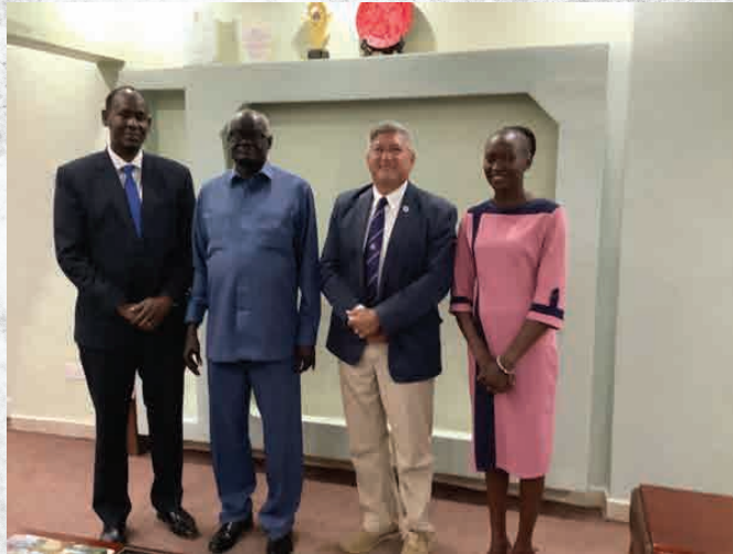
WITH THE MINISTER OF HIGHER EDUCATION SCIENCE AND TECHNOLOGY