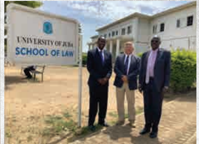
WITH DEAN OF SCHOOL OF LAW -UNIVERSITY OF JUBA