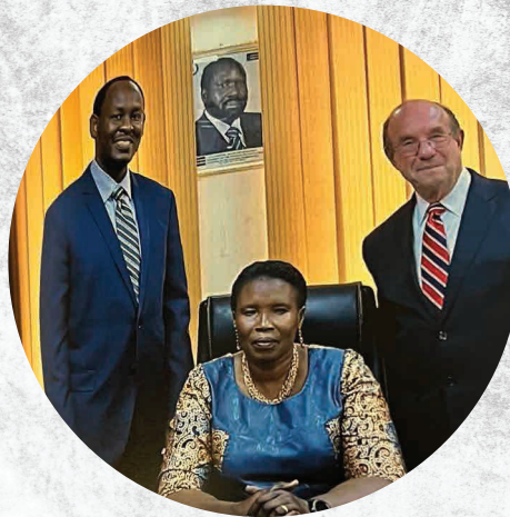
Theil and Dr. Charles' meeting with Hon. Nadia Arop Dudi - Minister of Culture, Youth & Sports